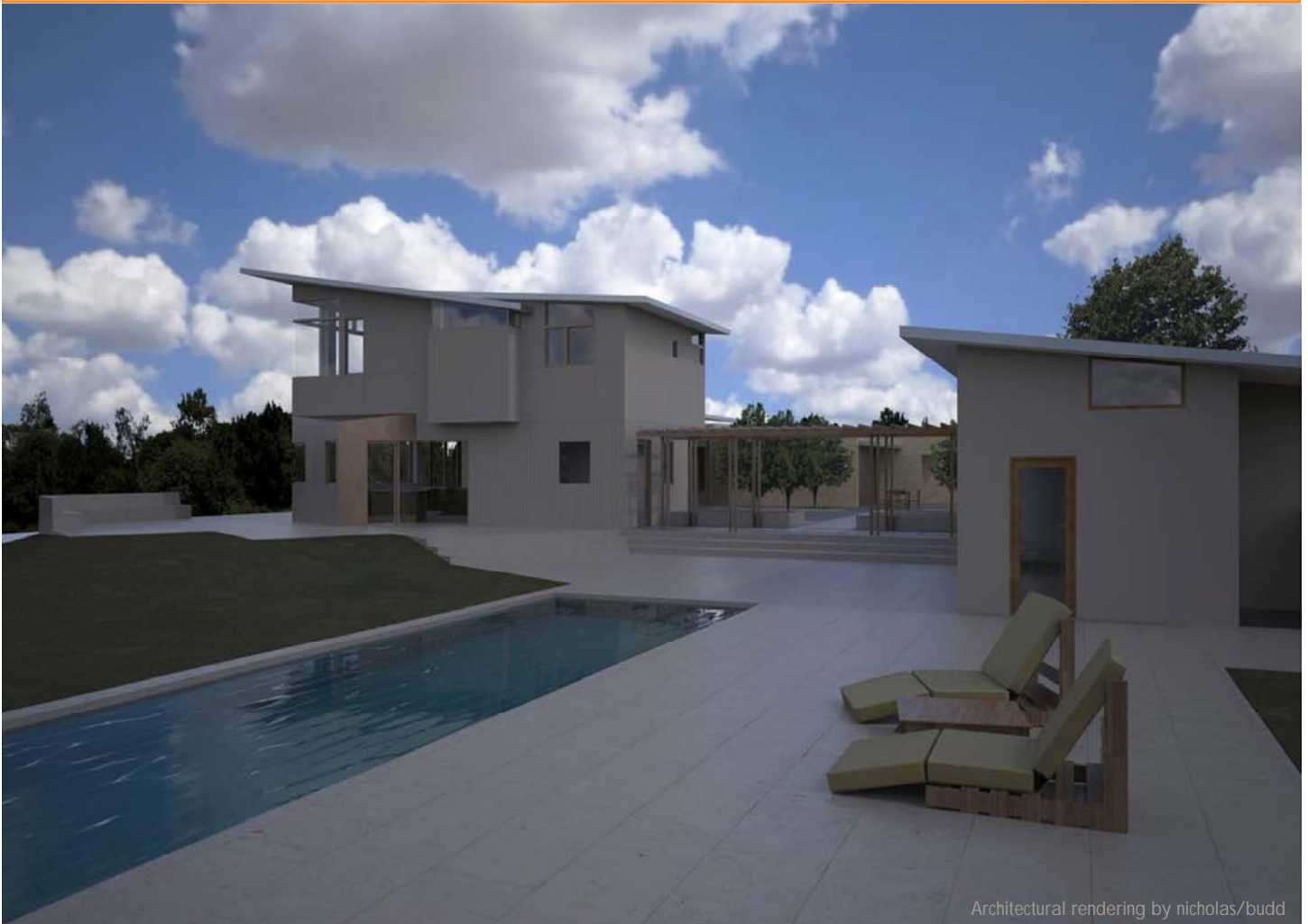
Architectural rendering by nicholas/budd